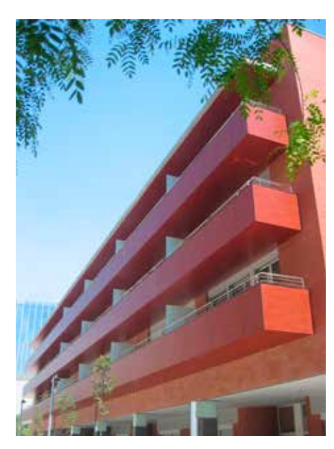
Housing complex | Barcelona | Spain

As a specialist in exterior cladding, Trespa can help with the right design choice.