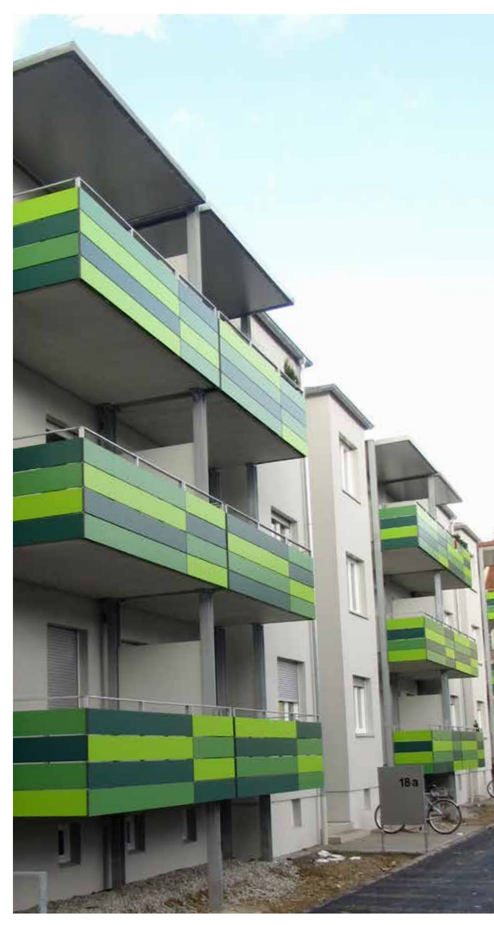
Angerhof | Augsburg | Germany